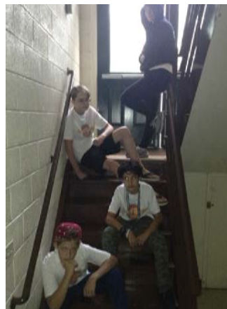
♥ Prepare for Battle