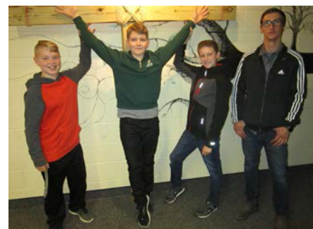
OCS Strict Discipline